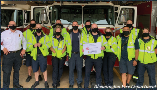
Bloomington Fire Department

✧ St. John Associates, the Local Council of Women, and BHF teamed up to purchase high visibility coats for the firefighters of the Bloomington Fire Department this year.