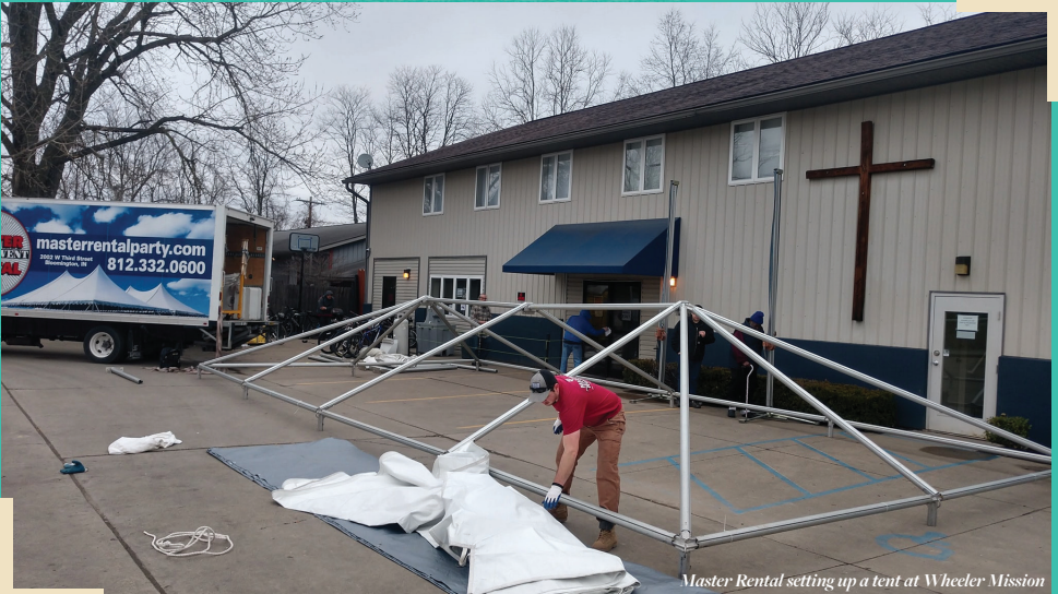
Master Rental setting up a tent at Wheeler Mission

the Greater Bloomington Chamber of Commerce, and the Bloomington Economic Development Corporation established the COVID-19 Cross Sector Coalition. The group convenes community leaders virtually to communicate pressing issues as a result of the pandemic and connects needs with solutions. The group is comprised of a diverse array of industries and includes schools, higher education, restaurants, retail, nonprofits, city and county government, and more.